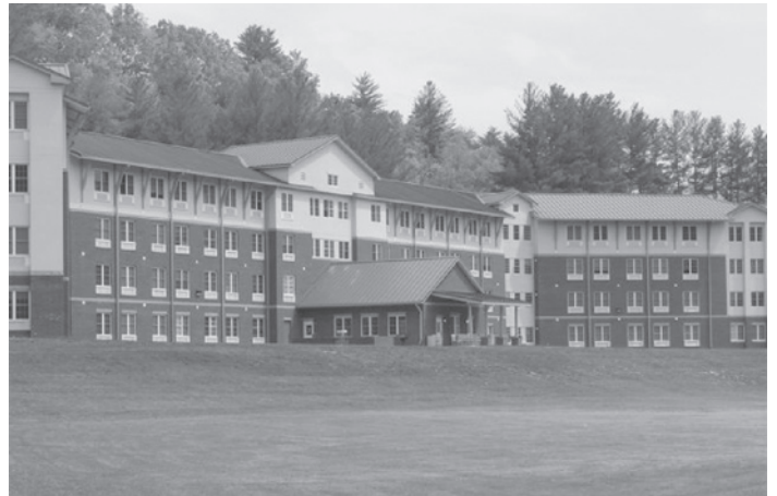
Norton Road Residence Hall

The 2009 catalog & on-line registration are at http://dulcimer.wcu.edu or request a catalog & registration form by phoning 828-227-7397 or sending a message to learn@email.wcu.edu .