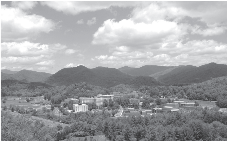
Western Carolina University, Cullowhee, NC

Located within a two-day drive of 1/3 of the nation's population, Western Carolina University and its surroundings blend the best of the traditional and the new in a beautiful mountain setting. Classrooms, concert halls and on-campus housing are all air conditioned and modern. Nearby the town of Sylva offers excellent shopping, supermarkets, restaurants and medical care. Just beyond that, Dillsboro is a rustic town known for its handicrafts. For information on area vacation attractions and campgrounds visit http://dulcimer.wcu.edu .